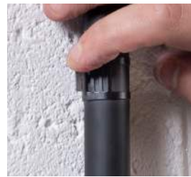
Secure cable with locking tab