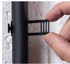
Simply wrap around the cable