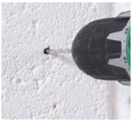
Drill a 5mm pilot hole