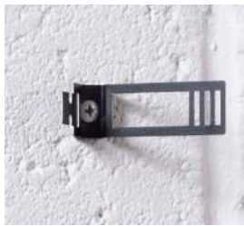
Secure screw-fix, no wall plug required