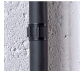
Tight fitment, neat appearance

These Cable Fixing Packs are ideal for EV charging cables. Each pack contains 20x fire-rated screws for masonry, concrete & brickwork; with no wall-plug required.