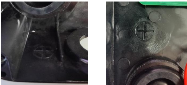
Figure 2 – Areas marked for installing additional glands

There are two marked areas for drilling to install a separate gland, suitable for a M12 or M16 gland.