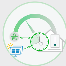
Export Control and Time-of-use Shifting