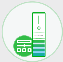
Elegant Modular and Unified Design