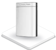
Residential Lithium Battery