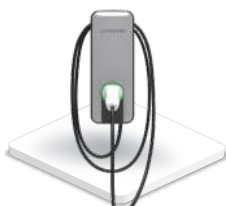
Smart EV Charger