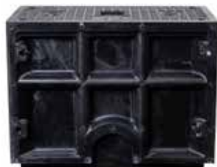
Medium 600 x 300