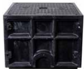
Large 600 x 600