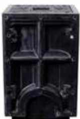
Small 300 x 300